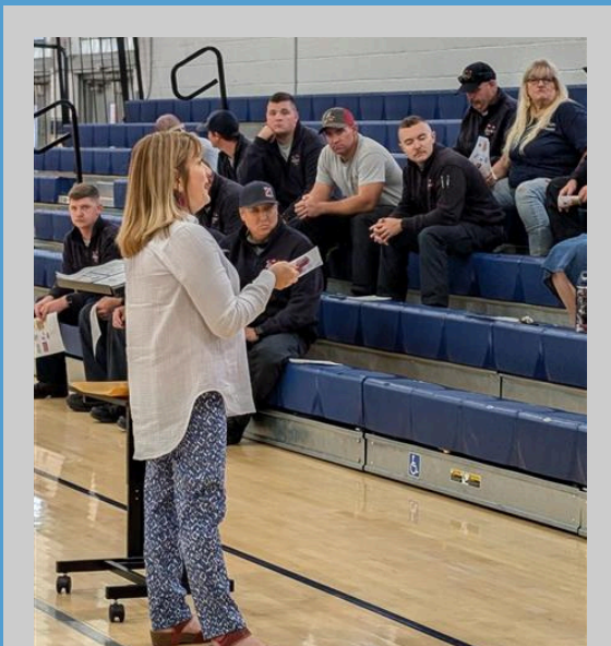
City of Asheboro September 2024